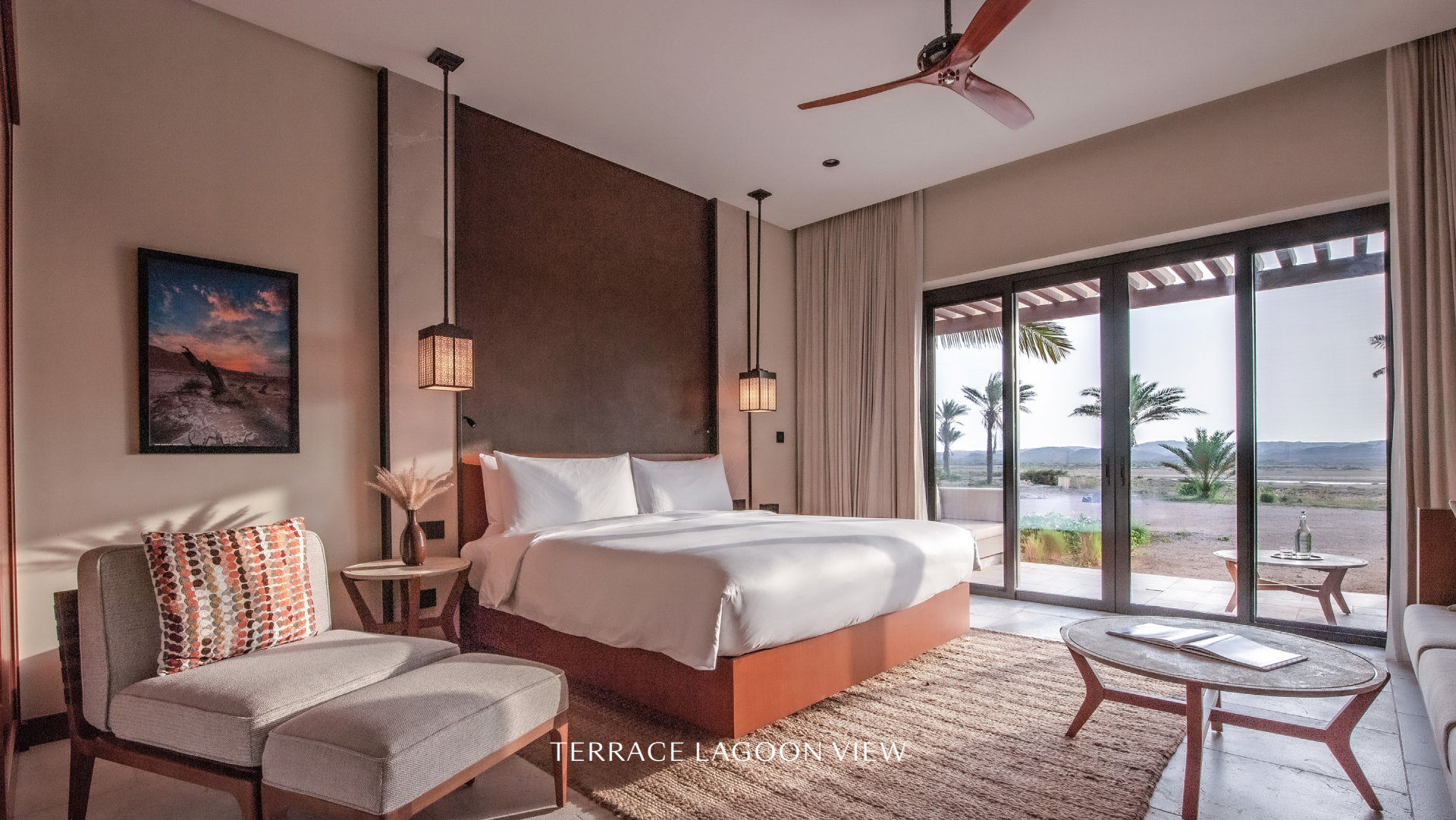
TERRACE LAGOON VIEW