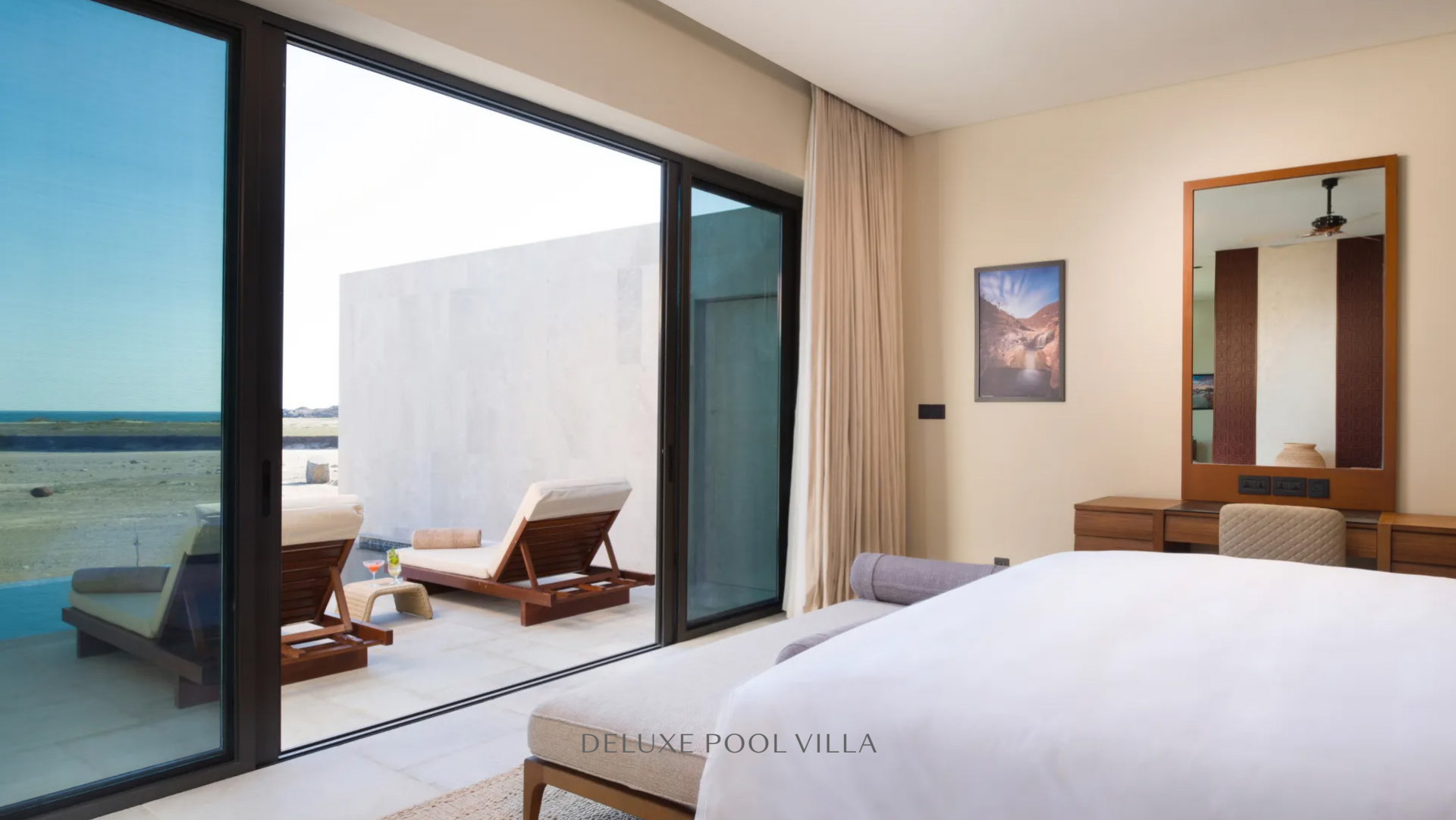
DELUXE POOL VILLA