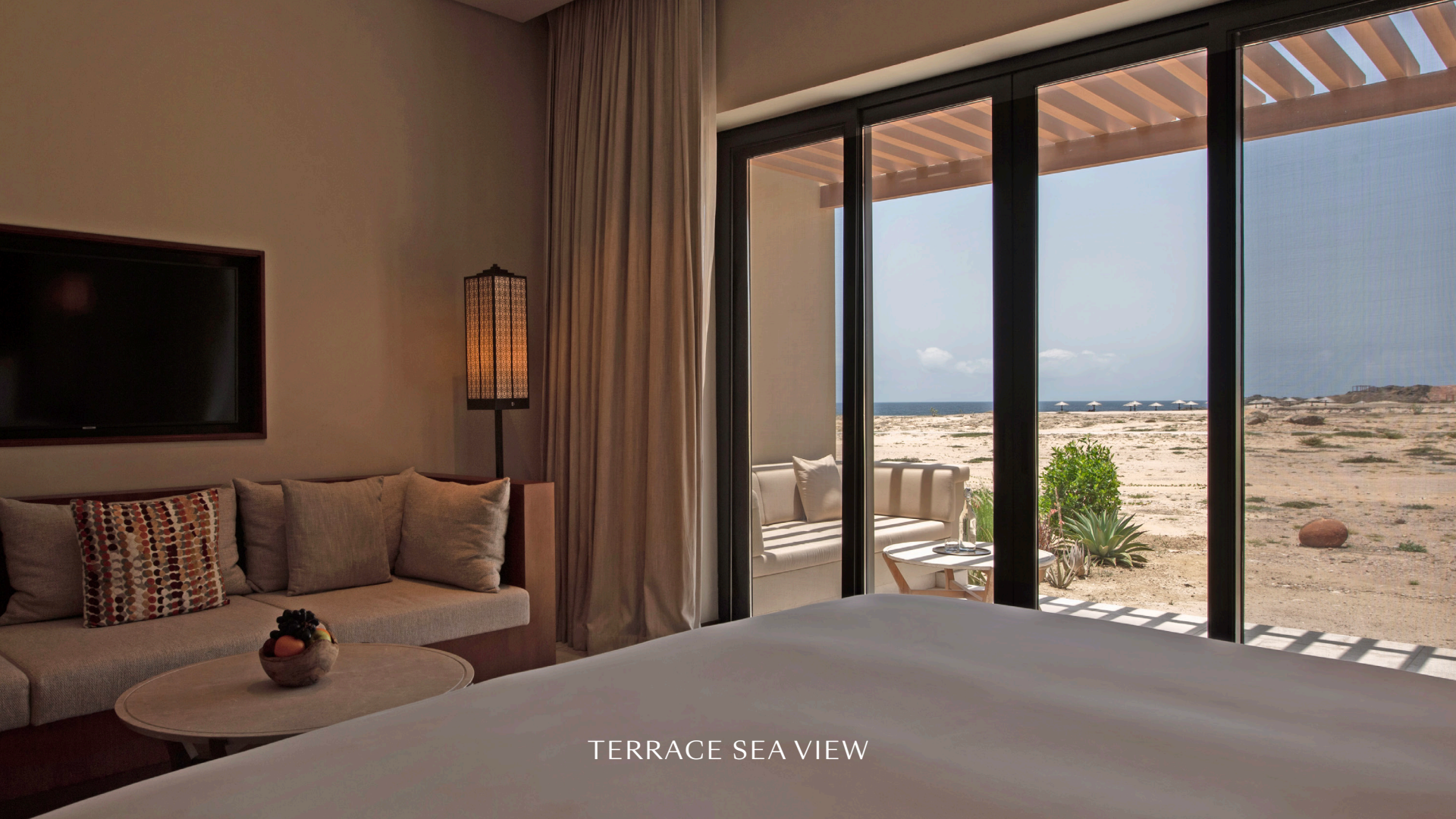
TERRACE SEA VIEW